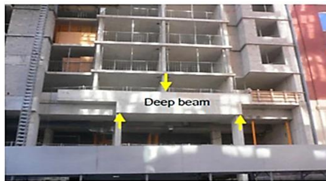
Fig. 1. Deep beams.

Reinforcement of beams with openings depends especially on its categories. In the construction industry, openings in deep beams are primarily classified as pre-planned or post-planned openings. Factors such as location, size and shape are already identified during the construction phase in pre-planned openings. Hence, it is beneficial to provide adequate reinforcement and serviceability of spandrel beams during construction. This factor improves the reinforcement behavior of a deep beam with openings. Considering the case of post-planning openings, the existing beam element is drilled for openings that affect the performance of the structure. However, specific guidelines or standards regarding structural element openings are not currently available in any of the major codes. During the process of loading the pipes and conduits of the installation, problems may occur. Opening positions in the deep beam are provided or relocated by mechanical and electrical engineers [14].