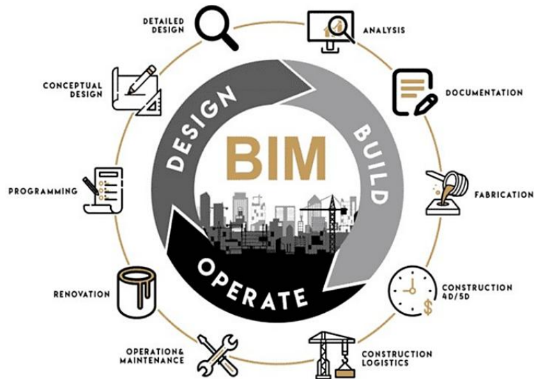
Fig. 2. Integrated BIM model.