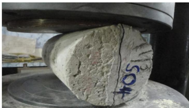
Fig. 2. Image of the concrete sample in the testing machine.

In this method, a diagonal compressive force is applied at a certain speed along the length of the cylindrical concrete test piece until rupture occurs. This loading causes tensile stresses on the surface subjected to relatively high compressive loads and stresses. Tensile rupture occurs earlier than compressive rupture because the load application surfaces are triaxial in compression. As a result, they bear much more compressive stresses than the uniaxial compressive strength test. For loading, thin support strips made of plywood are used to spread the applied load along the length of the cylinder.