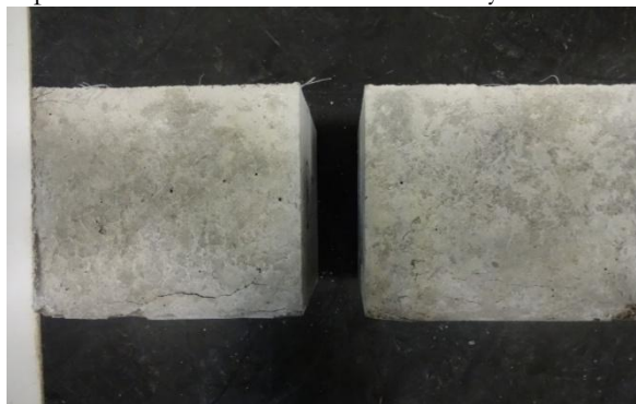
Fig. 12. Cracking pattern of concrete samples after pressure test.

Fig. 12 shows the concrete sample with composite fibers after the pressure test. Single-strand fibers mixed with network fibers can quickly form a broader network structure, reduce the stress concentration of concrete at the beginning of cracks, and thus increase compressive strength. Compared with the failure pattern of plain concrete, it can be concluded that the cracks on the surface of concrete reinforced with fibers are finer, more numerous, and widely distributed. It indicates that fiber-reinforced concrete is not entirely crushed under axial stress, and fibers play an essential role in strengthening the crack resistance, which causes multiple deviations from the crack propagation path and the occurrence of secondary cracks.