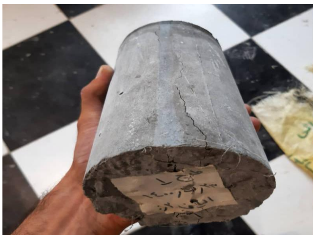
Fig. 13. Cracking pattern of concrete samples after tensile test.

According to the cracking pattern of the sample after the tensile test (see Fig. 13 ) in the initial stage of concrete cracking, several primary fibers eliminate micro-cracks and prevent expansion. When the tensile stress breaks the samples, the stress is transferred to the coarser and stronger monofilament fibers, so it can stop the large cracks and improve the crack tensile strength significantly.