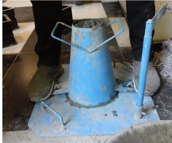
Fig. 9. Poured concrete in the slump cone.

placed on a hard, non-absorbent surface. This cone is filled with fresh concrete in three stages, and each time, it is hit 25 times with a metal rod; in the third stage, the concrete surface becomes completely smooth and uniform (see Fig. 9 ). At the end, the cone is completely pulled up, and the amount of concrete falling is measured compared to the initial level.