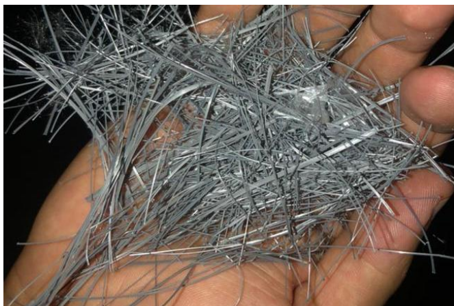
Fig. 3. Needle-shaped polyolefin fibers.