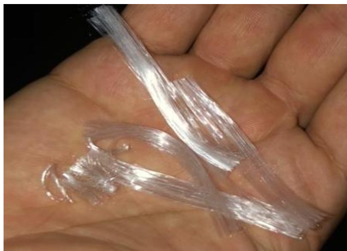
Fig. 4. Polyolefin network fibers.