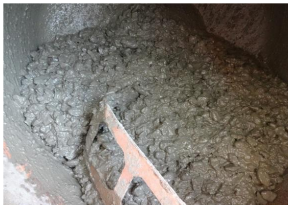
Fig. 6. Fresh concrete after compaction in molds.