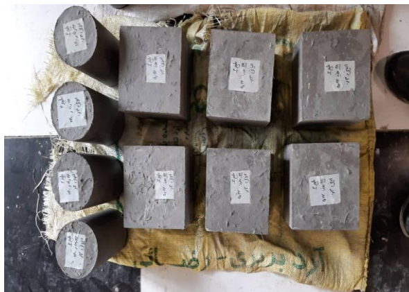
Fig. 7. Concrete samples after being removed from the mold.