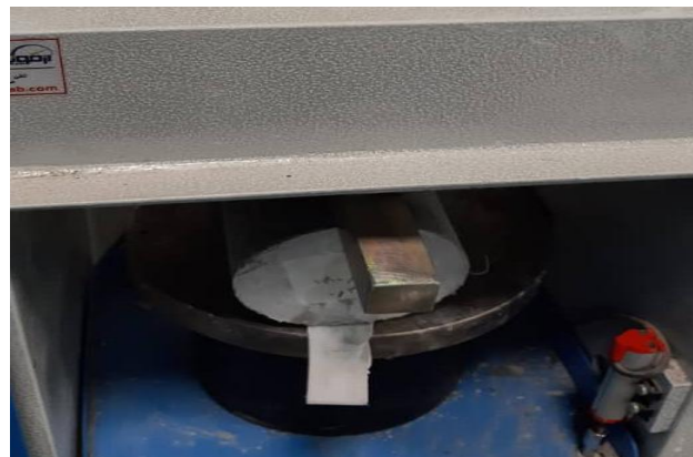
Fig. 10. Placing the cylindrical sample in the machine.

This test was done based on the ASTM C496 standard on cylindrical samples with dimensions of 20 x 10 cm [9]. The sample was placed horizontally between two metal strips inside the fragile concrete device, and the test was performed ( Fig. 10 ). The relation T=2P/\pi ld was used to calculate the tensile strength value. P is the load caused by sample failure, l is the height, and d is the diameter of the standard cylindrical sample [10].