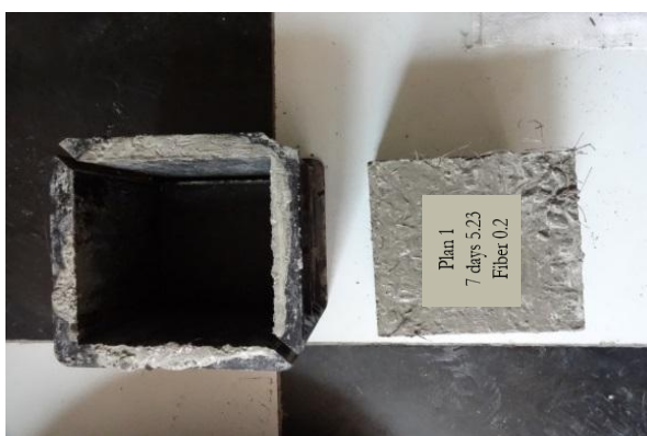
Fig. 8. Concrete samples 24 hours after construction.

For the compressive strength test, cubic samples with dimensions of 15 cm and tensile strength were considered on cylindrical samples with dimensions of 20 x 10 cm. Table 5 shows three compressive strength samples, and two tensile strength samples were made for testing at 7 and 28 days. Twenty-five samples were tested for compressive strength and 20 samples for tensile strength.