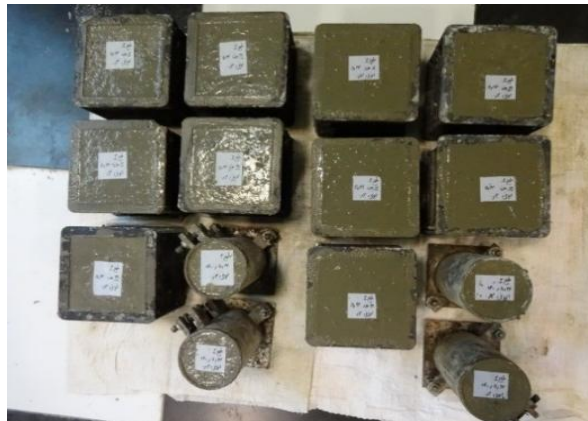
Fig. 5. Materials after complete mixing.

The complete mixing of materials is necessary to produce uniform and quality concrete. In order to make concrete samples, after the appropriate combination of aggregate, dry Portland cement is mixed with the materials according to the mixing plans for one minute, and fibers are added by hand. After that, water and super-plasticizer were added, and The act of combining the ingredients for 5 minutes was done well (Fig. 5). The next step was concreting, which was done by pouring the concrete into standard molds already greased with suitable oil. The concretes were poured into the molds during three stages and by pounding 25 times with a metal rod to better compact and homogenize the mixture (Fig. 6). After manufacturing, all samples were placed in the open air of the laboratory and removed from the molds after 24 hours for processing (Fig. 7). The samples were placed in a water tank at a suitable temperature entirely below the water level to process the concretes until they reached the desired age and strength. (Fig. 8).