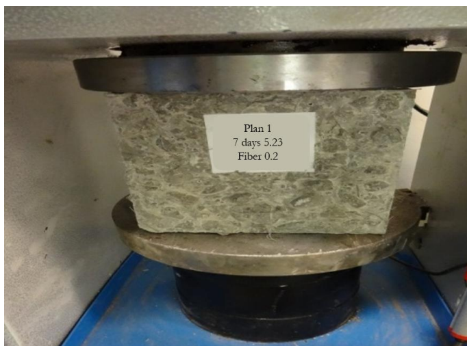
Fig. 11. Placing the cubic sample in the machine.

Compressive strength is the ability of the structure to carry loads on its surface without any cracking or deflection. In fact, the material under compression tends to decrease in size, while in tension, we encounter an increase in the sample length [11]. The compressive strength of concrete depends on many factors, such as water-cement ratio, cement strength, quality of concrete materials, quality control during concrete production, etc. The compressive strength test was performed according to the ASTM C39 standard on cubic samples with a dimension of 15 cm [12]. The exact weight of the compressed samples was obtained with a scale one day after they were taken out of the water. After that, the sample was placed in the machine's center from the flat part and tested (see Fig. 11 ).